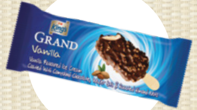
KING'S GRAND BITES VANILLA $2.50