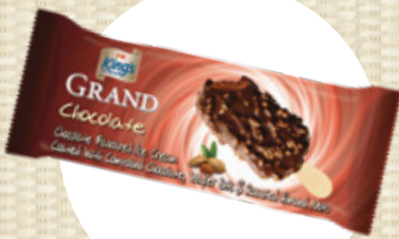
KING'S GRAND BITES CHOCOLATE $2.50