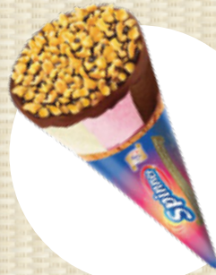
KING'S SPINNER NEAPOLITAN $2.80