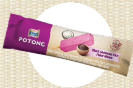
KING'S POTONG PULUT HITAM $1.80