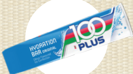
100 PLUS HYDRATION BAR $2.30