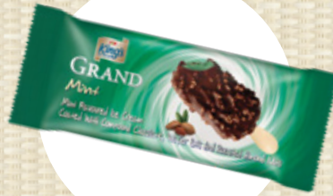
KING'S GRAND BITES CHOCOLATE MINT $2.50