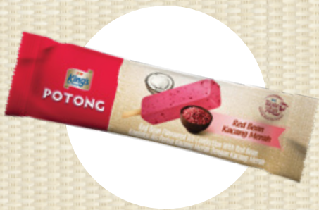
KING'S POTONG RED BEAN $1.80