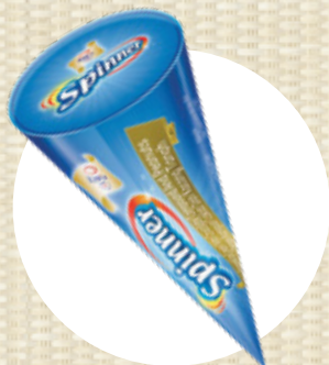
KING'S SPINNER VANILLA $2.80