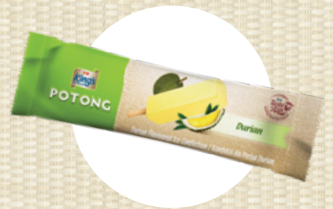
KING'S POTONG DURIAN $1.80