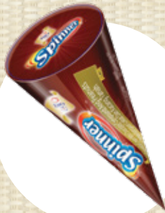
KING'S SPINNER CHOCOLATE $2.80