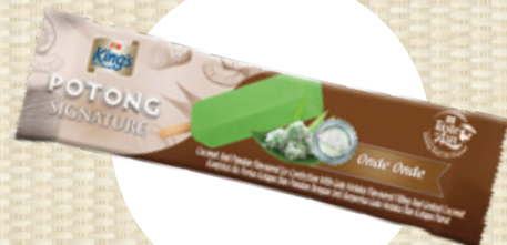
KING'S POTONG ONDEH ONDEH $2.00