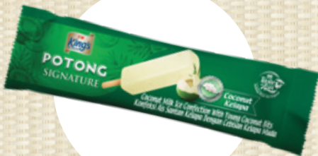
KING'S POTONG SIGNATURE COCONUT $2.00