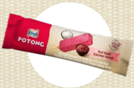
KING'S POTONG RED BEAN $1.80