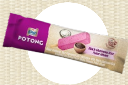
KING'S POTONG PULUT HITAM $1.80