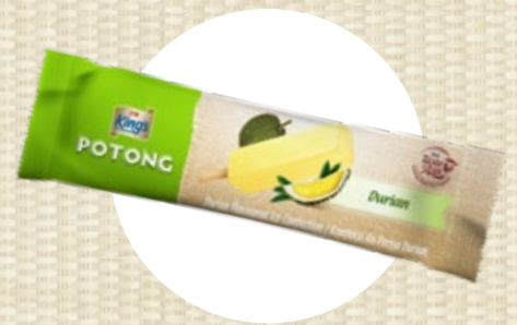
KING'S POTONG DURIAN $1.80