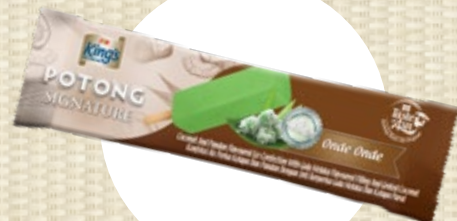
KING'S POTONG ONDEH ONDEH $2.00