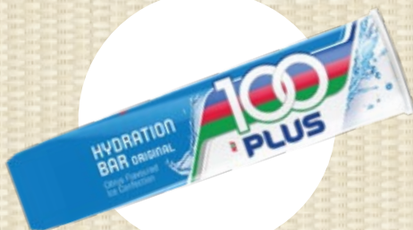
100 PLUS HYDRATION BAR $2.30