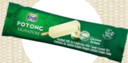
KING'S POTONG SIGNATURE COCONUT $2.00